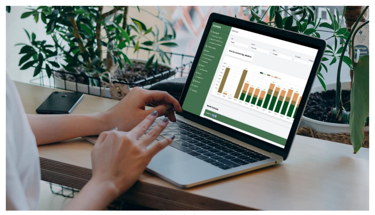
Dashboard of ECOVISEA

The emission factor data used in ECOVISEA is provided by <u>Climatiq</u>, a carbon calculation engine. This data upholds the global standard and is compliant with the GHG Protocol and ISO 14067.